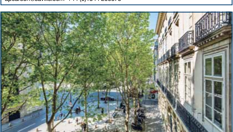
PARIS, PLACE SAINT-SULPICE, 6E

3rd floor place Saint-Sulpice apartment lacktriangle large living room lacktriangle kitchen lacktriangle 2 bedrooms ◆ office/child's bedroom in mezzanine ◆ 2 baths ◆ ideally situated ◆ 85 sq m Guide €1.768 million