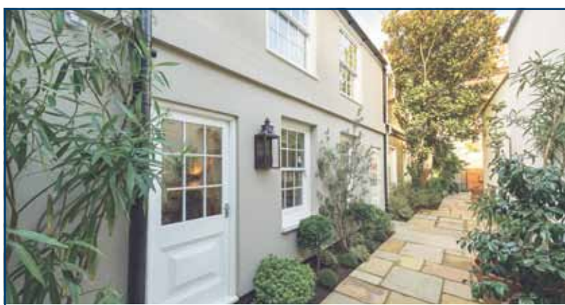
LONDON, CHELSEA SW3

jburdess@savills.com +44 (0)20 3813 3840