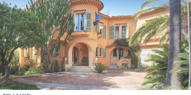
FRANCE, SAINT JEAN CAP FERRAT

Charming villa of 432 sq m ◆ private gated estate ◆ 6 en suite bedrooms ◆ 2 reception rooms ◆ staff accommodation ◆ landscaped gardens ◆ swimming pool Price on application