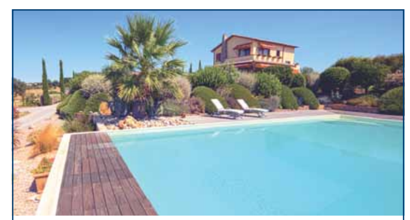
ITALY, MAREMMA, MAGLIANO IN TOSCANA

capferrat@savills.com +44 (0)20 7877 4702