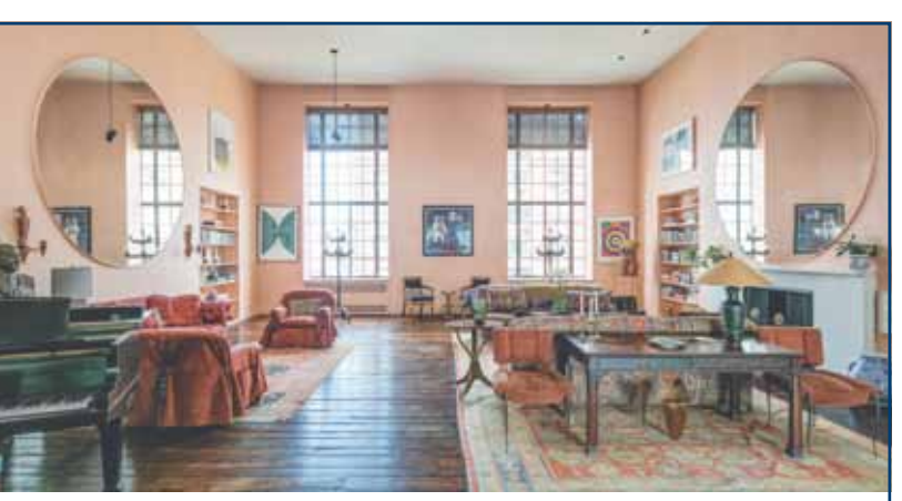
NEW YORK, MANHATTAN

jcvjetkovic@savills.com +44 (0)20 3813 3840